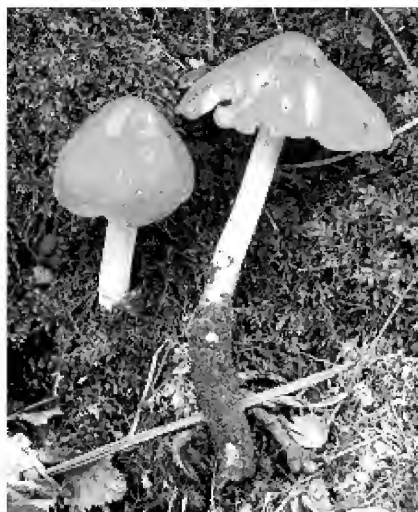
Caulorhiza hygrophoroides at May 21, 2005, Wildcat Mountain State Park